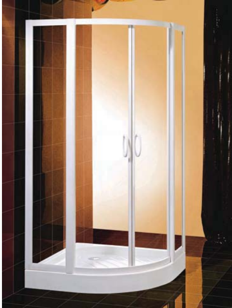
*1 year limited manufacturer's warranty included