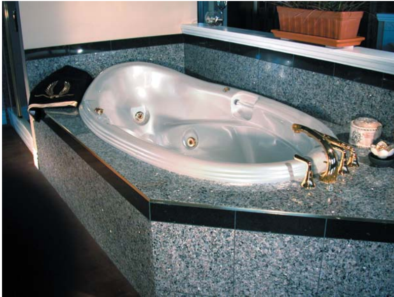
* Water & Air jet packages are not included in the base model of this bathtub